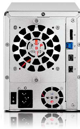
EB400CR Rear View