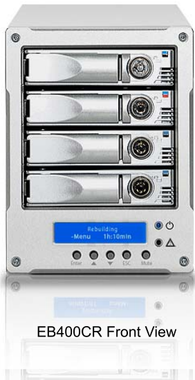
EB400CR Front View